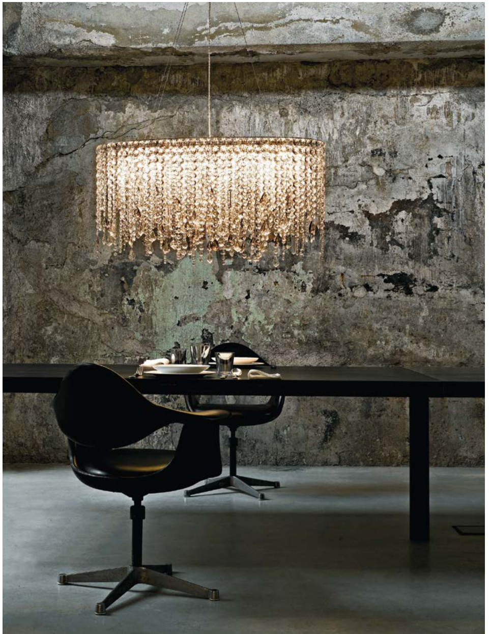
in the picture Vladimiro elliptic 100

Via Fratelli Vivarini 7, I-20141 Milano, Italy tel +39 02 895 023 42 fax +39 02 895 409 74 info@lollimemmoli.it www.lollimemmoli.it